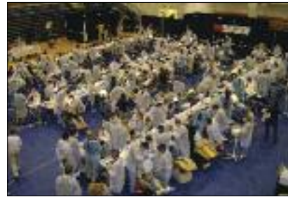
Patients receive dental services at the clinic.

As part of a two-day medical, dental and vision clinic, a team of GLMS physicians and medical students helped provide free care at Pike County Central High School on June 19-20. The GLMS Foundation's Medical Missions Committee offered the opportunity to volunteer at the event run by Remote Area Medical-Kentucky.